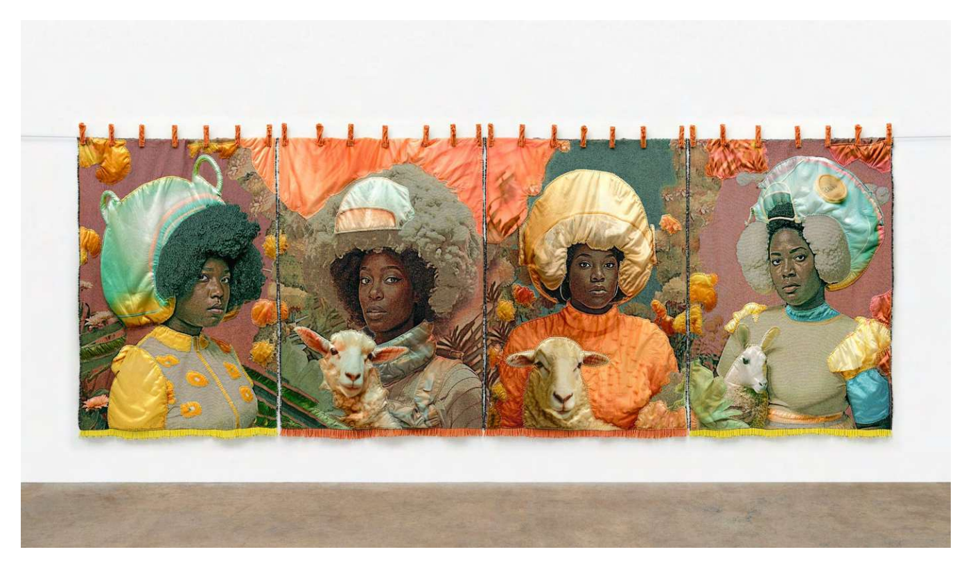
April Bey, We Will Not Apologize for Being the Universe; Our Own Constellation. Don't You Know Light Lives in Dark Places Too?, 2025 (detail)